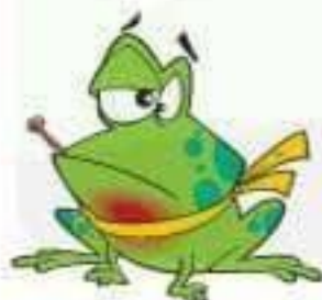
a sore throat