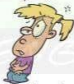
a stomachache (US) a stomach ache (Brit)