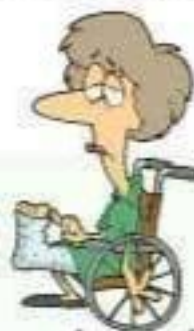
a broken leg